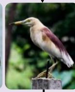
Indian Pond Heron