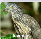
Malayan Night Heron