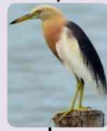
Javan Pond Heron