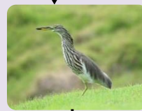
Pond Heron sp.