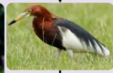
Chinese Pond Heron