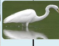
Pacific Reef Heron